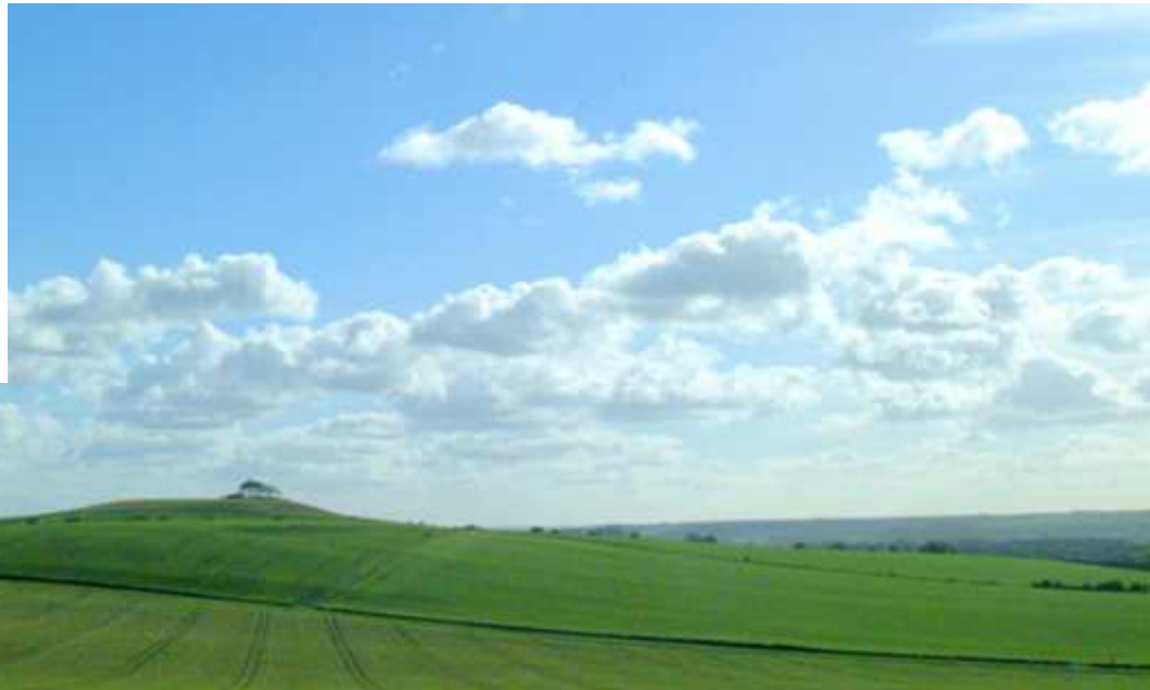
The Pewsey Vale